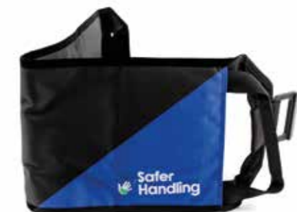
Available in Black or Blue